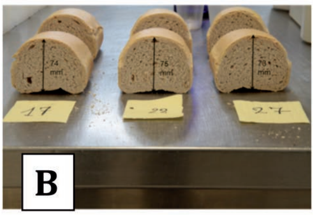
Figure 2. Height of the breads with different mixing times. A: PM1; B: PM2.