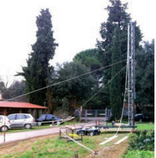
Figure 3. Pile driver under construction; uplifting; stays hooking system, and pile driver in working position.