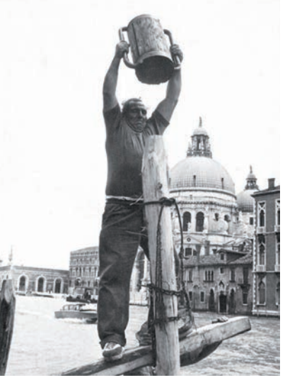
Figure 1. Pile driver model, owned by the GESAAF, and a present-day hand operated pile driver in Venice.