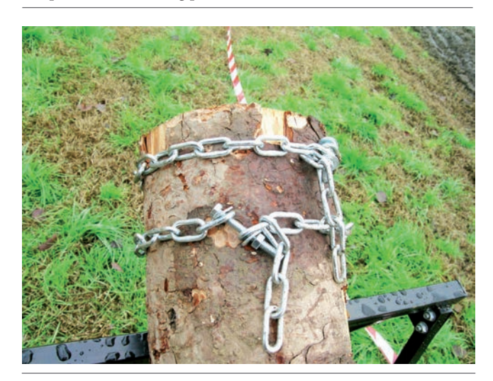
Figure 4. Pile head frettage.