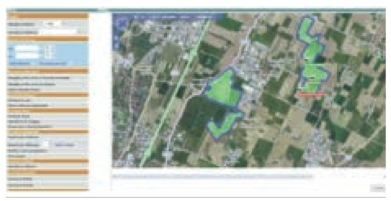
Figure 2. Website overview, mapped areas and tractors monitored during operations.