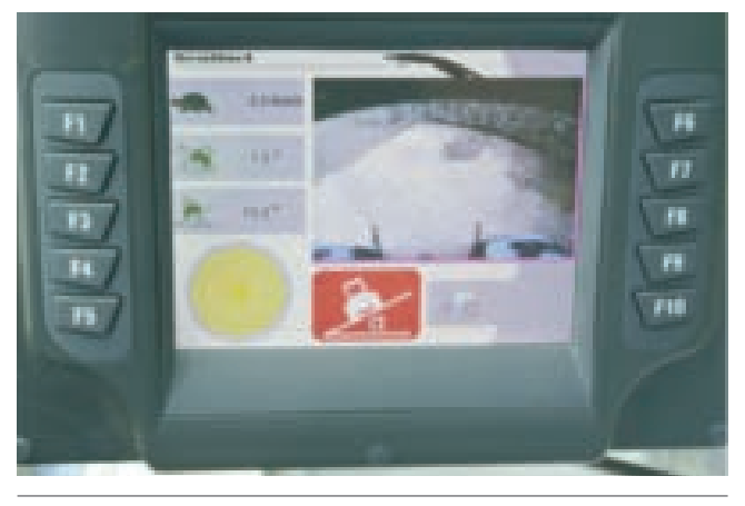
Figure 4. Multisensor display device during the static test.

The multisensor unit is normally fixed on the tractor roof to be perfectly horizontal, while the visual warning display is fitted on the tractor cab to be monitored from the driver's seat. The device is complemented by a dedicated website, which allows to geo-reference the farm parcels and record tractor types, operators and implements.