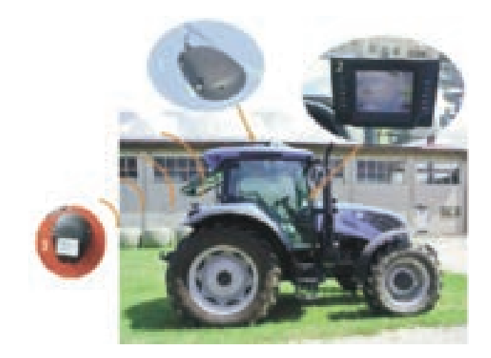
Figure 1. Tractor fitted with multisensor device, main controller (1), visual warning display (2), implement transceiver (3).