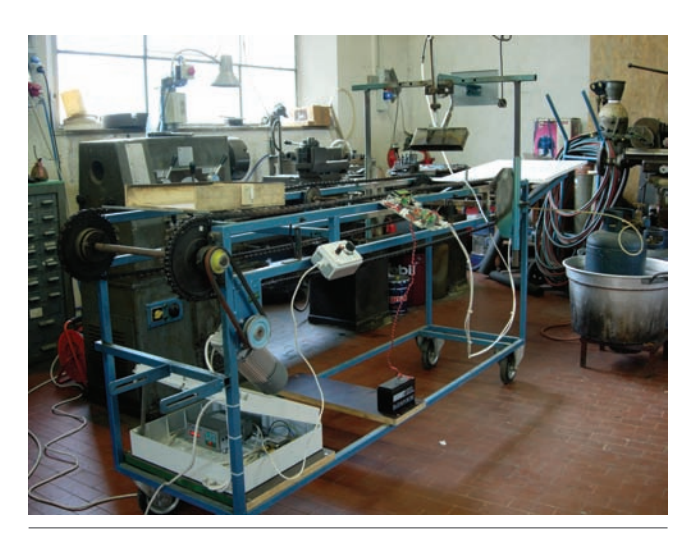
Figure 1. Test bench for flaming treatment in controlled conditions

The burners are fixed into the frame of the test bench, while the targets of flaming are conducted to the flame through a specific chain belt. A burner was arranged frontally with respect to the advancement direction of the containers on the belt conveyor, simulating the operating conditions. The LPG supply was provided by a tank equipped with a