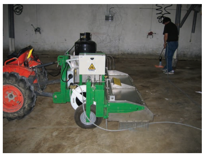
Figure 5. Flaming treatment in the broiler house: use of the lateral burners and the manual lance of the Officine Mingozzi flaming machine. This equipment was built in order to treat the base of the walls and the areas that the tractor was unable to access.