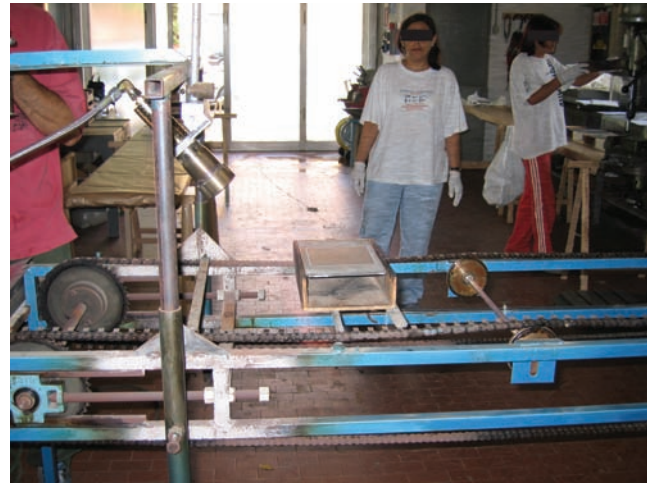
Figure 2. Flaming treatment of a pre-inoculated steel plate on the test bench.