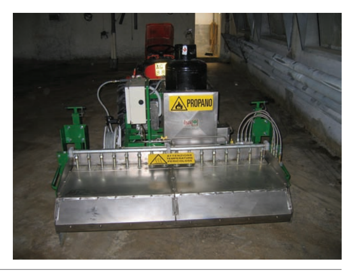
Figure 4. Lateral and rear views of the Officine Mingozzi flaming machine which can be coupled to a low power machine and used on the second floor of a poultry house.