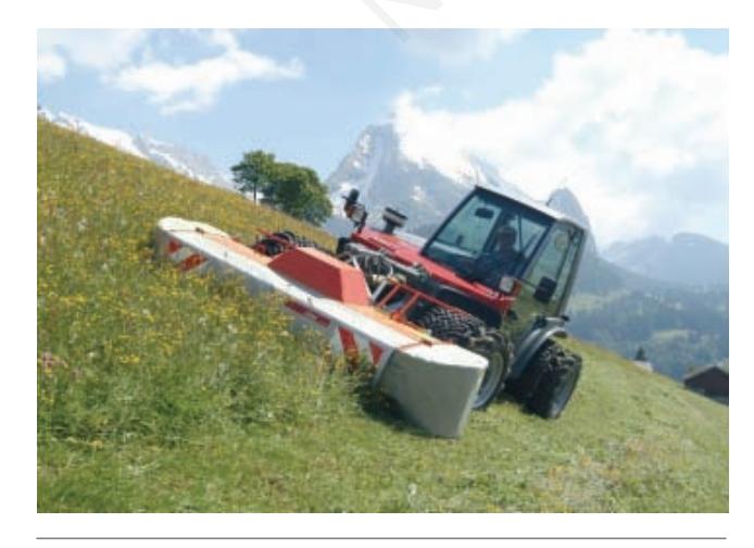
Figure 1. Hill-farm tractor.

The survey asked farmers to give repair costs, including service agents' bills, for the last three years for each machine. The question-