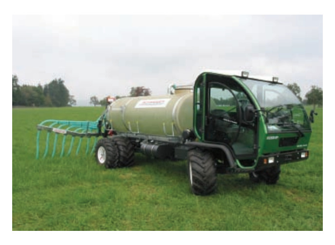
Figure 2. Transporter for upland mechanisation with mounted slurry tanker.