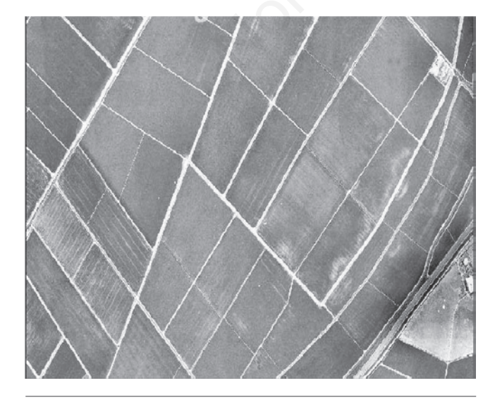
Figure 1. Low volume roads in an irrigated area of Spain. Mesh system.

Outside of irrigation areas, a tree-like (Figure 2) network design was used. In this case, the final objective was to provide access to any