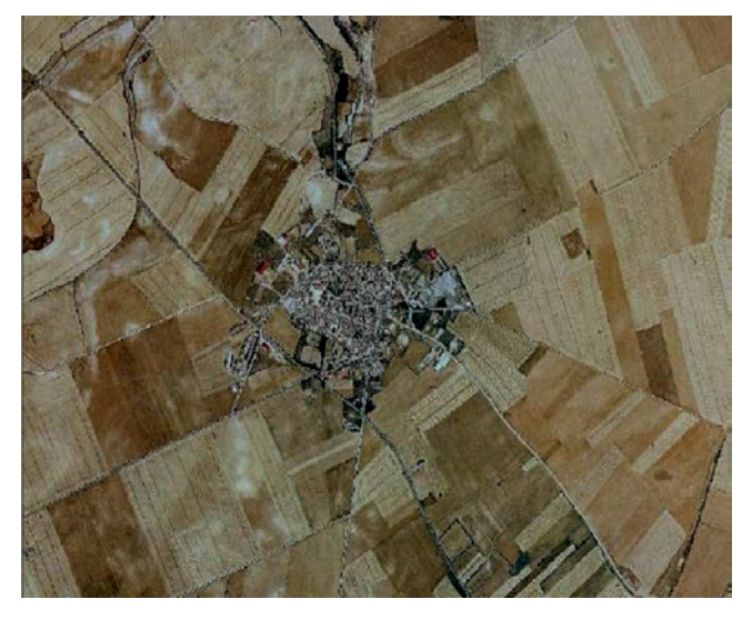
Figure 2. Low volume roads in a dry land area of Spain. Tree system.