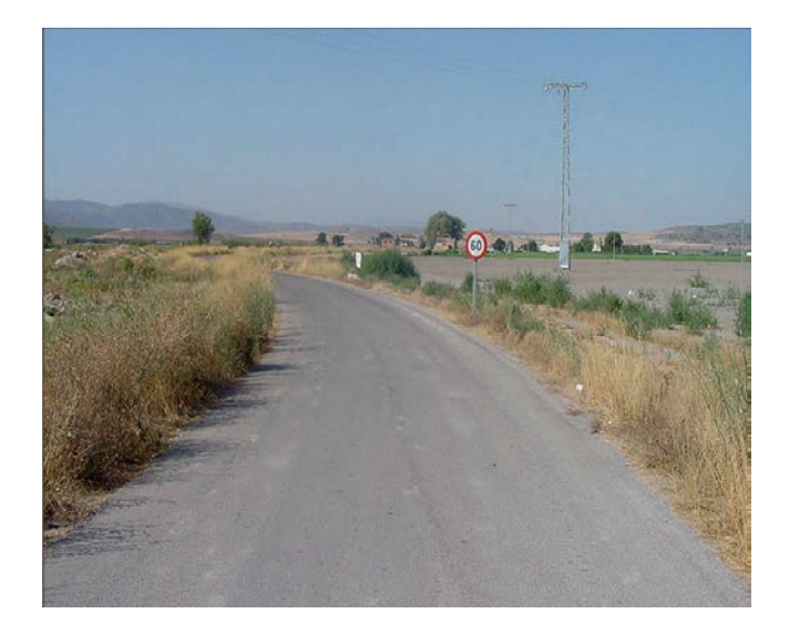
Figure 4. Low volume road paved with a double surface treatment.

Low volume road networks were mainly designed to provide access to farming operations, which is an eminently private enterprise restricted to the primary sector. The planning of the network followed a traditional top-down policy, which has been typically implemented in developing regions after Second World War (Njenga and Davis, 2003). The central planning defined areas of prior interest where low volume road network should be constructed in order to modernise agriculture there. Thus, the needs and desires of local population were not considered in many cases. This caused the perception in the final users that they had not any responsibility in the maintenance of the roads.