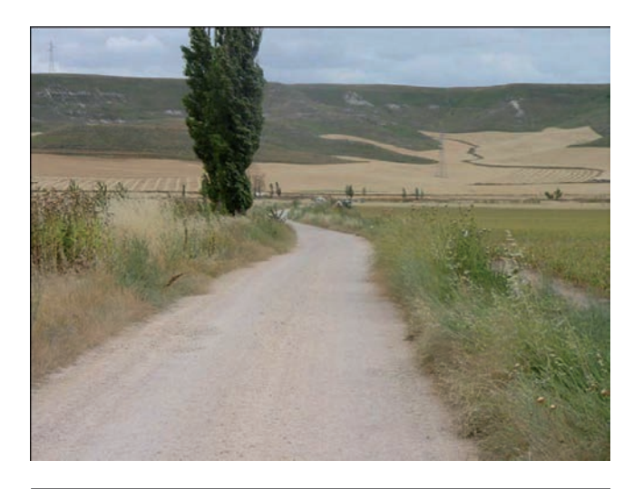
Figure 3. Low volume road paved with macadam.

During this era great part of the low volume roads were constructed in rain-fed lands, where the profit made per hectare was much lower than in irrigated areas. The use of stabilised granular materials was therefore relatively more expensive in these areas. Alternative solutions using available local materials were therefore sought, and consequently the low volume roads made in these areas differed in quality depending on their importance within the network. Main roads were made by using the best materials. Otherwise, some secondary roads were made employing better techniques, but many secondary and all tertiary roads were constructed in a more rudimentary fashion. Indeed,