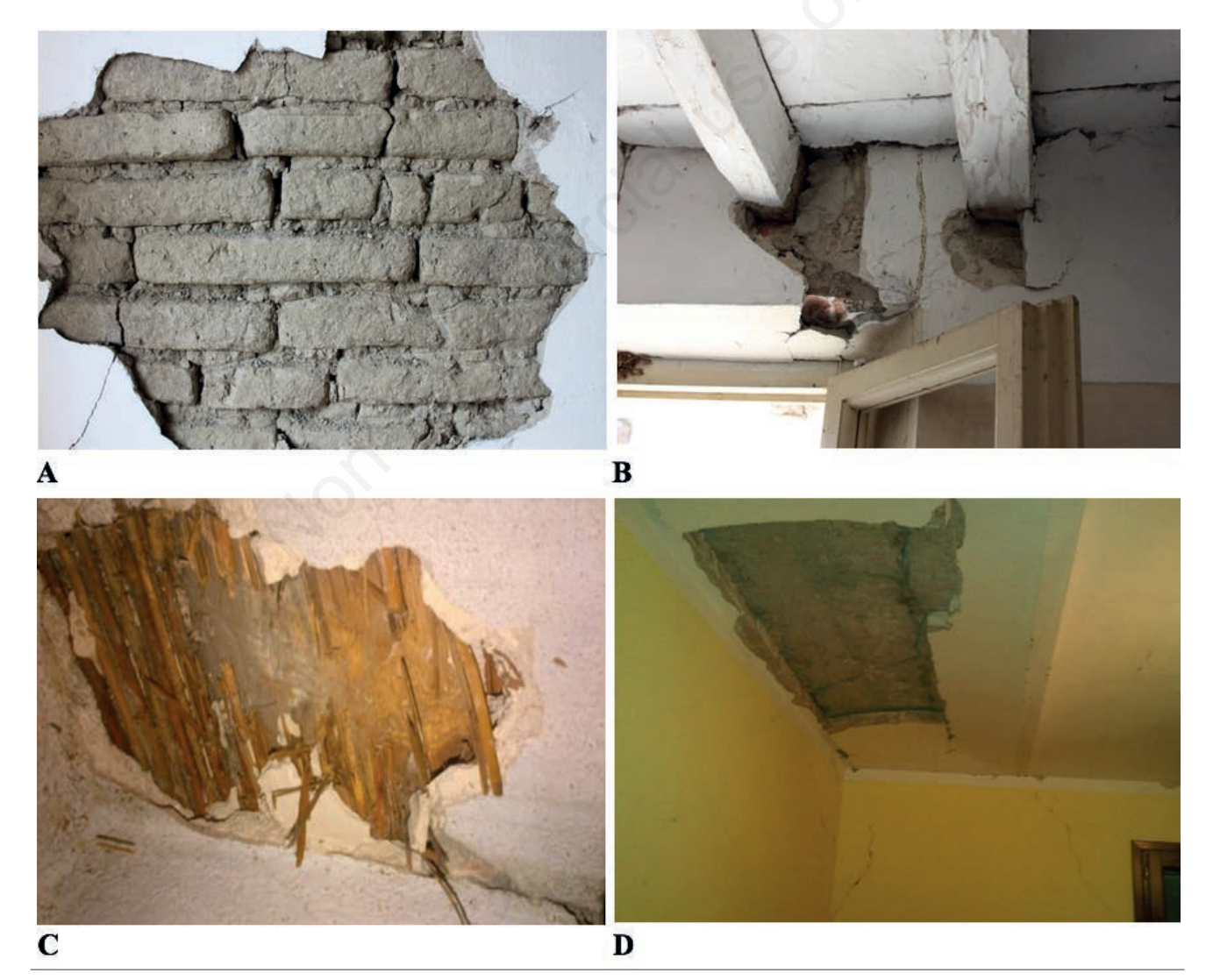
Figure 3. Particulars on materials and construction techniques of historical rural buildings. A) Masonry wall texture. B) Structure of a wooden floor; C) Cane panels protecting timber beams. D) Vaulted masonry floor.