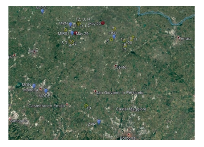
Figure 2. Area stricken by the Emilia earthquakes reporting the position of epicentres of May 20^{th} and May 2^{9th} ground motions (red circles), the location of buildings constituting the stock of the present paper (yellow stars) and accelerometric registration stations (blue markers) with the codes reported in Table 2.

Figure 2B. The porta morta represented a protected passage where the peasants undressed before entering the house, and sometimes was used to collect and dry spices and small amounts of cereals. The volume was typically open, with a masonry arch on the front side, and closed by walls on the back, and this gives the name. In more modern buildings, the porta morta was opened on both façades, and the backside closed by a removable wooden door. Two main typologies of rural dwellings exist: larger ones, with several families inhabiting the house (i.e. patriarchal home); smaller ones, where only one family used to live (i.e. mono-nucleus home). Alberti, in the XV century (Alberti, 1450), provided a detailed description of the functional organisation of the peasant house that reflects in a very representative way the buildings currently present in the Emilia area. Typically, the greatest farms had other types of buildings, in order to store more hay or protect tools. The most widespread types are the barchessa and the casella, that are isolated rectangular buildings, 4-6 meters high, with 6-10 m and 15-20 m plan dimensions, respectively for the transverse and the longitudinal direction. The barchessa was vertically closed on three façades, instead the casella just on one or two. For the classification and subdivision of the building stock of the present