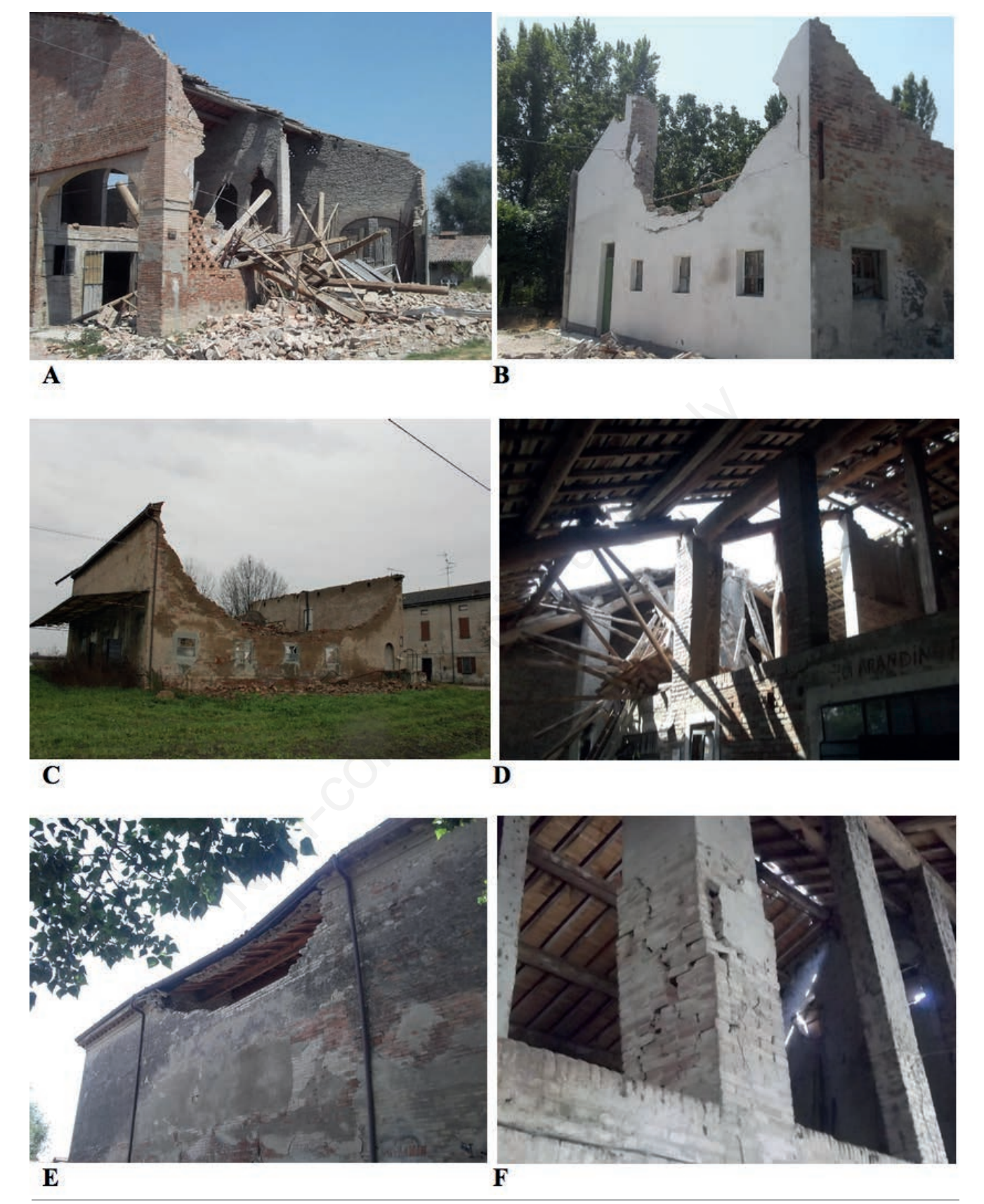
Figure 5. Main damages to building group A2. Example of catastrophic stable-hayloft collapses for: A) overturning of the façade (bldg. #1); B) out-of-plane vertical flexure (bldg. #18); and C) horizontal flexure mechanism (bldg. #10). D) Loss of support of the roof beams for the excessive deformations of the building (bldg. #4). E) Overturning of a limited portion of masonry panels for the horizontal force transmitted by the beam elements of a flexible roof (bldg. #1). F) Severe damage at the base of a slender masonry column (bldg. #4).