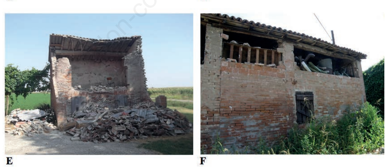
Figure 6. Main damages to category A3 and A4. A) Collapse of a barchessa building (bldg. #22); B) Lateral view of a casella (bldg. #11) with particulars of severe damages to: C) masonry columns due to excessive shear force; and D) infill walls for detachment from the structural columns. E) Structure collapse with loss of support of the roof structures (bldg. #21); and F) overturning of masonry infill walls due to the erroneous arrangement of the bricks (bldg. #17).