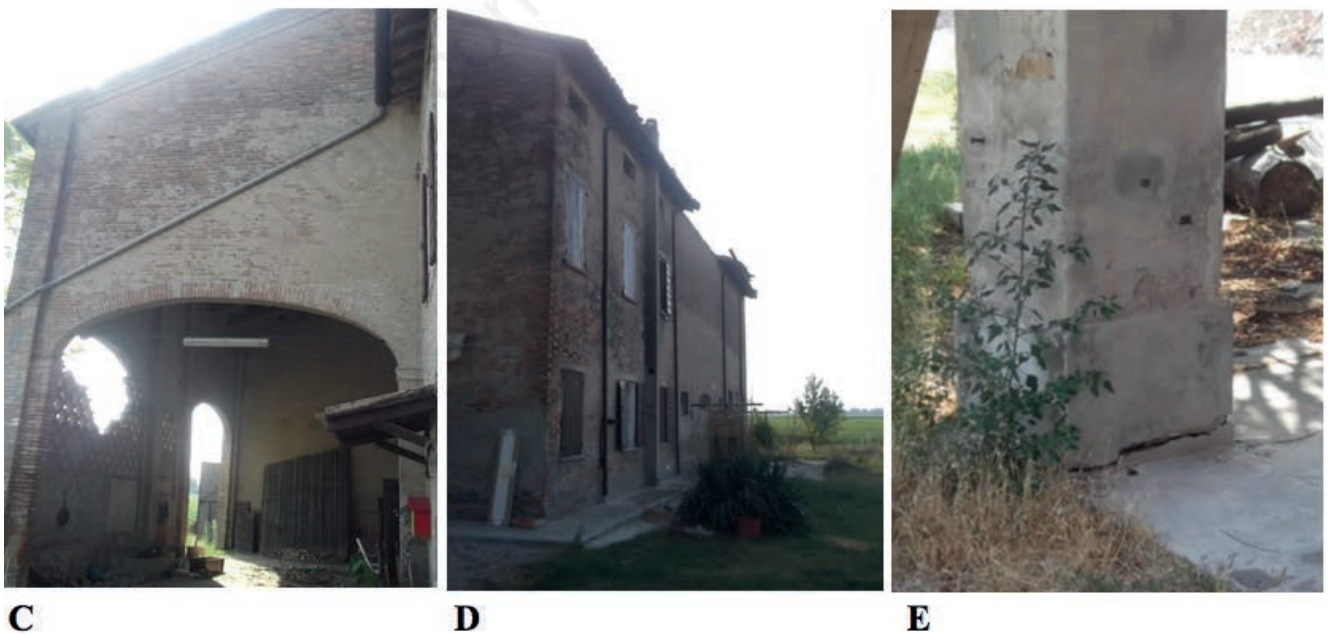
Figure 7. Particular of damages to category B buildings and non-structural elements. A) Fallen of timber roof beams from the intermediate wall in a composed building # 8. B) Corner opening between orthogonal walls poorly connected (bldg. #8). C) Failure of gelosie , typical holed infill walls (bldg. #5). D) Fallen of a portion of the perimeter masonry cornice (bldg. #5). E) Cracking at the base of a masonry column portico (bldg. #7).