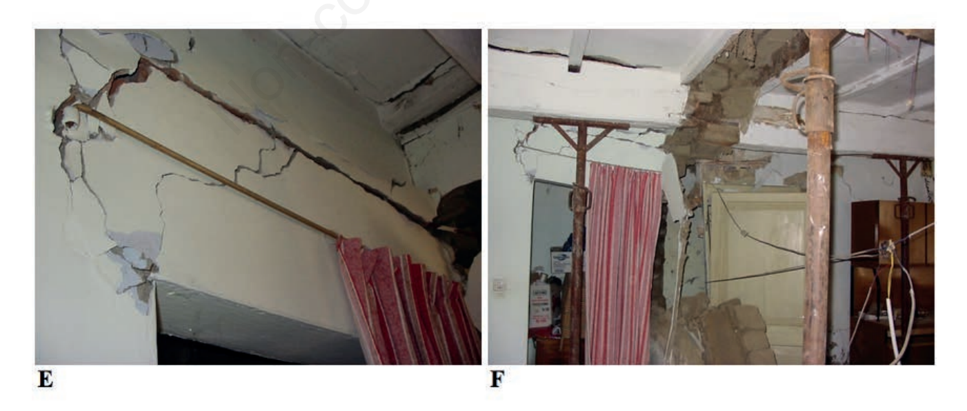
Figure 4. Main damages to building category A1. Example of in-plane damages induced by seismic force on: A) partition walls (bldg. #2); and B) structural walls (bldg. #6); C) cracking of corner between two orthogonal masonry walls (bldg. #1); D) loss of support of a wood beams from the masonry panels (bldg. #2); E) view of a lintel failed; and F) arch collapse (bldg. #20).